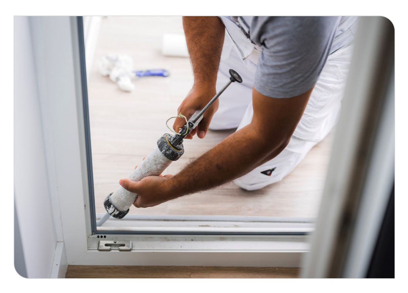
Version 3.1 • 02 December 2024 – 02 December 2029