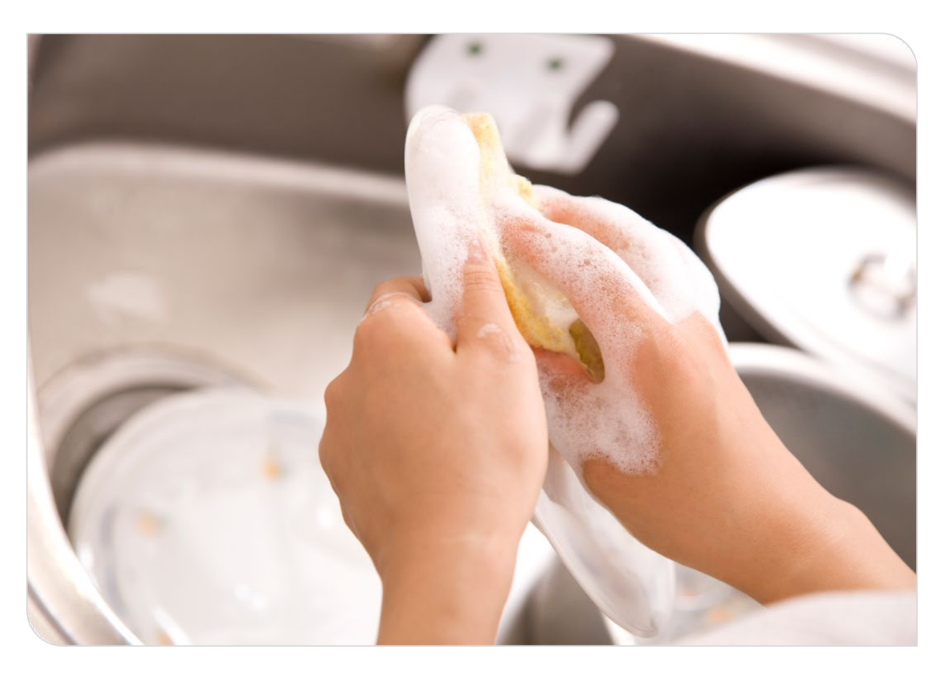
Version 6.9 • 14 March 2018 – 31 December 2025